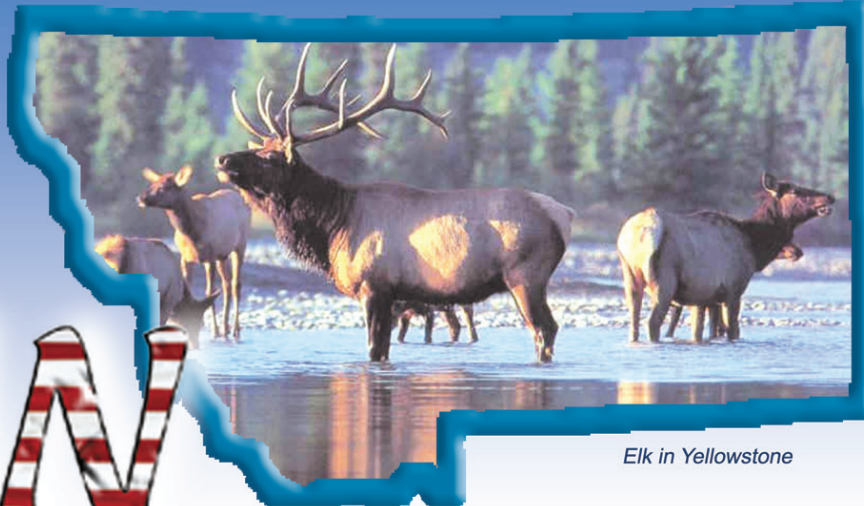
Elk in Yellowstone