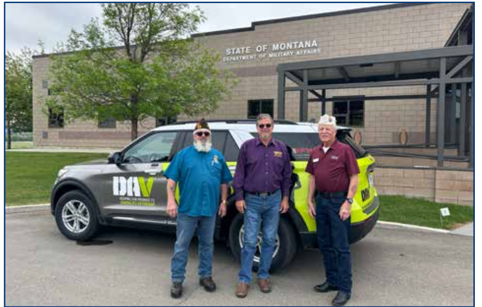
The DAV of Montana brought the SUV that Post 10010 of East Helena donated money to purchase over to the State VFW Headquarters.