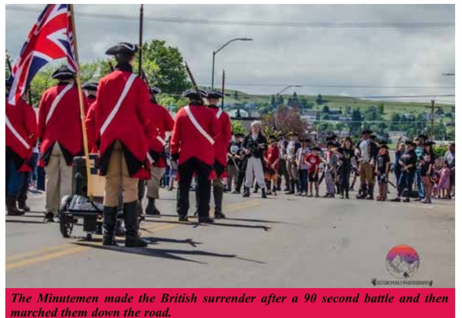
The Minutemen made the British surrender after a 90 second battle and then marched them down the road.