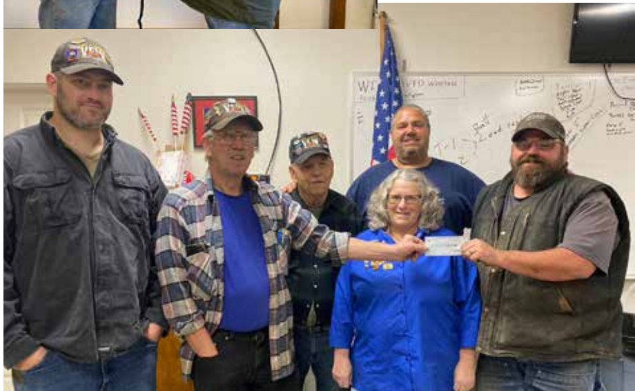
Post 5514 Post and Auxiliary Libby Montana Presented 2 Checks to the Libby Firemen Fund. Post 5514 presented a check for $3072.00 and Post 5514 Auxiliary presented a check for $700.00