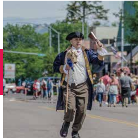
Paul Revere then came down then street warning us of the approaching troops.