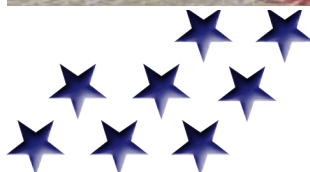
Post 4067 Malta, Montana participates in the Night of Lights Parade.