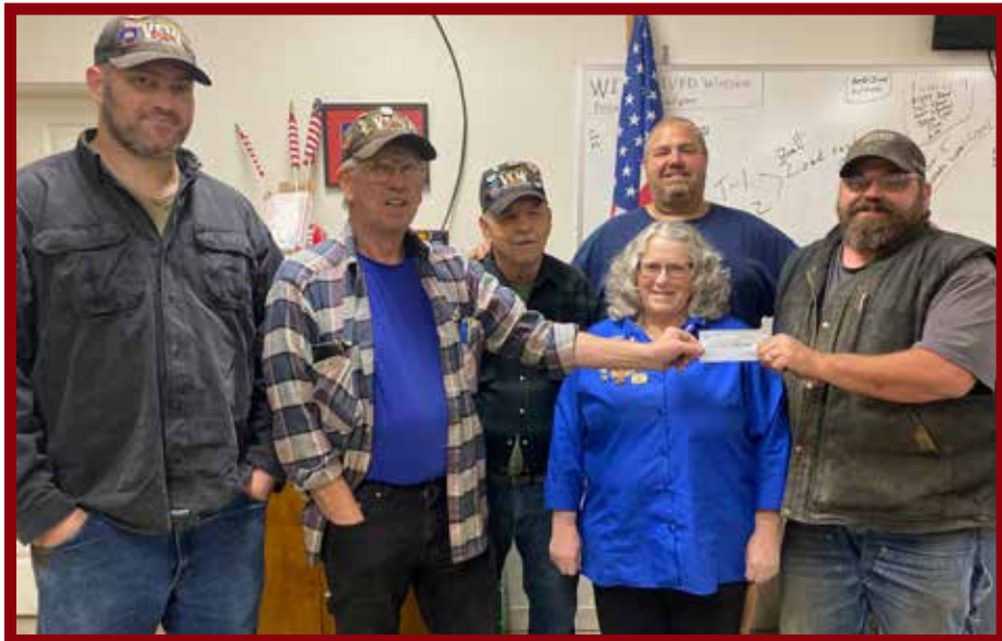
Post 5514 Post and Auxiliary Troy Montana presented 2 Checks to the Libby Firemen Fund. Post 5514 presented a check for $3072.00 and Post 5514 Auxiliary presented a check for $700.00