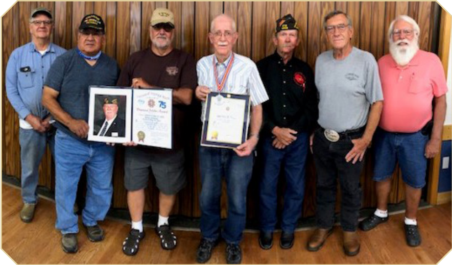
Sidney Post 4099 Members