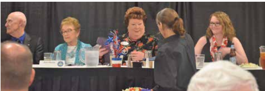
Centerpieces on the tables at Banquet