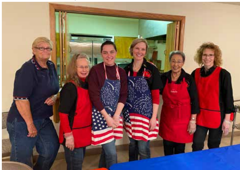
Auxiliary members preparing the lunch meal after the parade and ceremony. Served over 225 meals - leftovers went to God's Love in Helena, a homeless shelter.