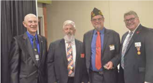
Post 10010 East Helena