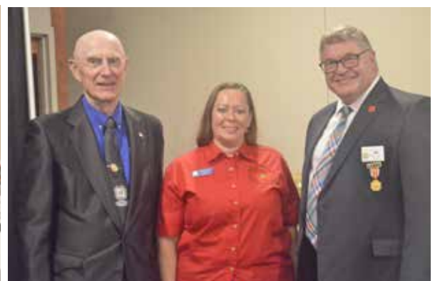
Post 3596 Plains