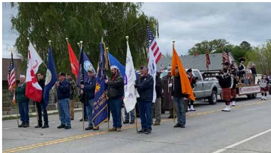
Color Guard pausing at the bridge while the wreath is placed in the Prickly Pear Park