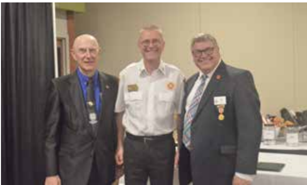
Post 2252 Kalispell