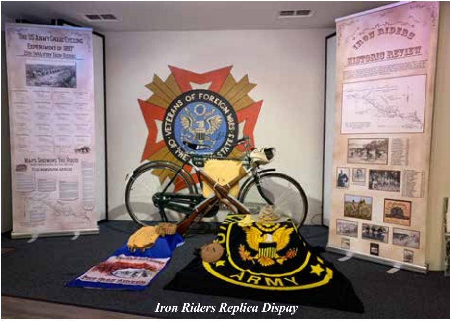
Iron Riders Replica Display