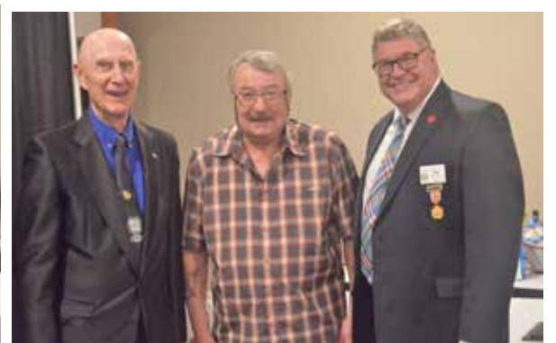
Post 4047 Fort Benton