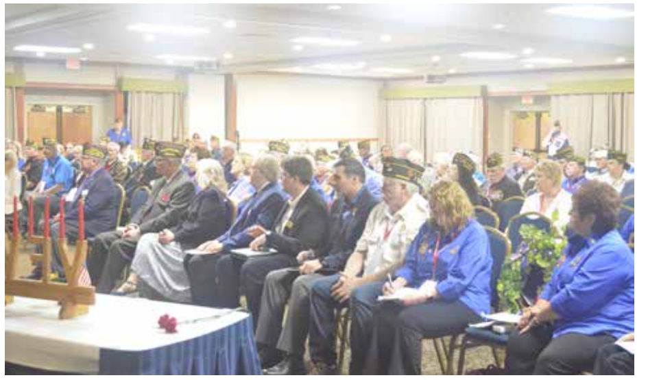
Members at State Convention