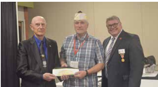
Post 12177 Fort Harrison