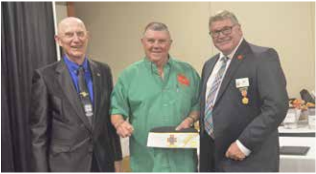
Post 3107 Glasgow