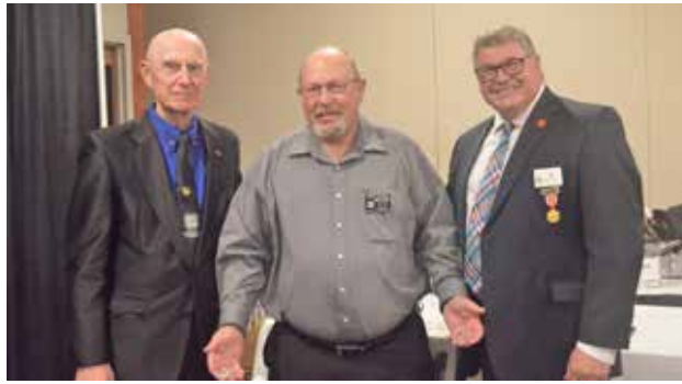
Post 1448 Butte