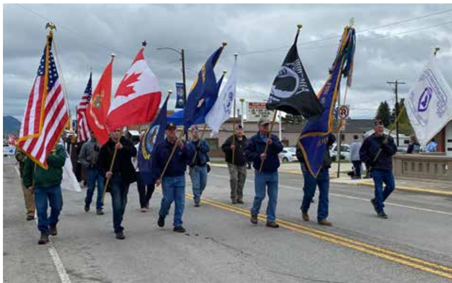
Marching down Main Street-East Helena, Montana.