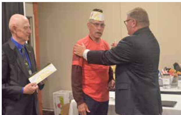
Post 2154 Livingston