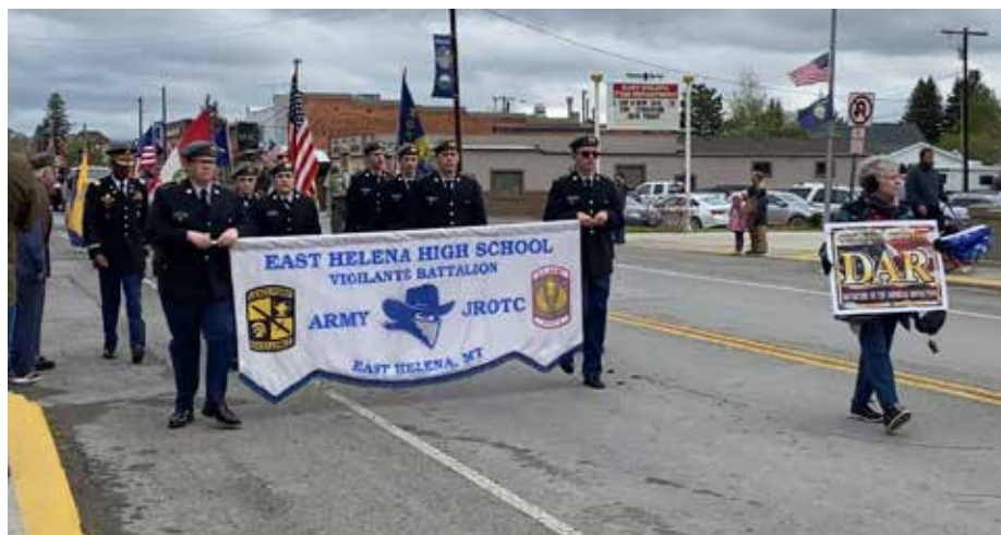
East Helena High School JROTC marching in the parade.