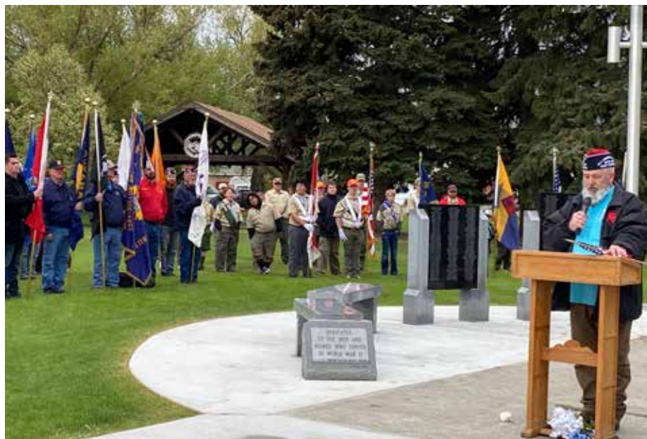
Memorial Day ceremonial at East Helena Main Street Park.