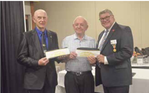
Post 4041 Big Fork