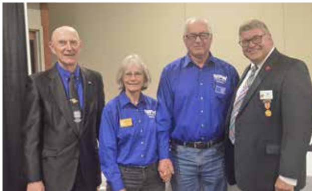
Post 6786 Eureka