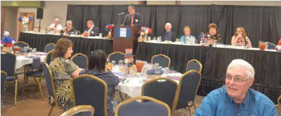
Banquet Head Table

The Banquet, which was held on Friday 17 June 2022 at the Billings Hotel and Convention Center, was a huge success. Post 6774 and the Auxiliary did an outstanding job. After the meal it was time to hand out the awards.