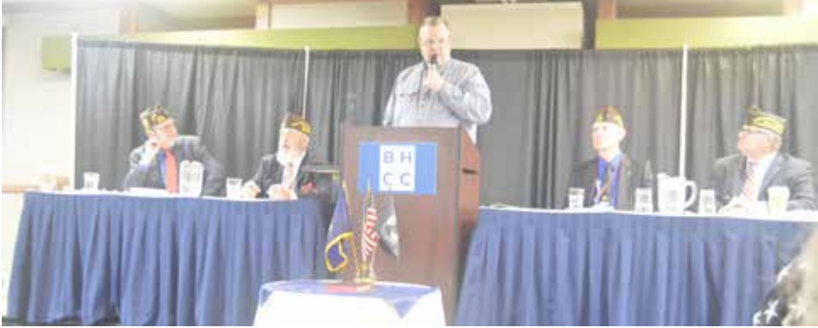
Senator John Tester at State Convention