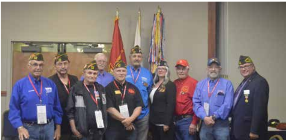
Post 276 Whitefish MT Community Activities National Winner