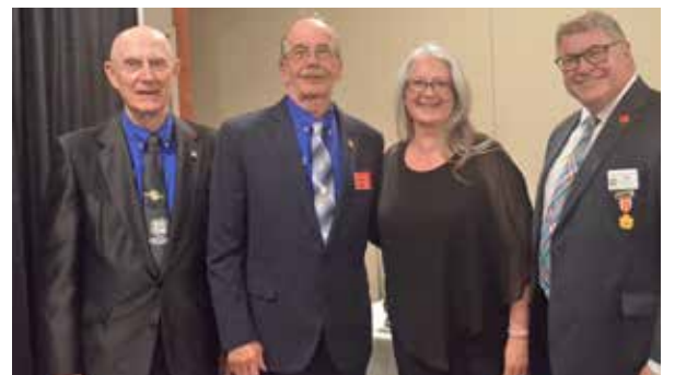
Post 276 Whitefish