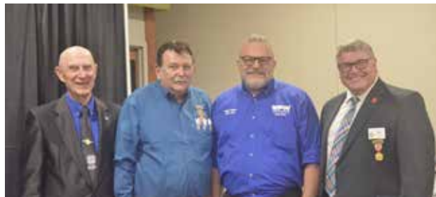
Post 6774 Billings