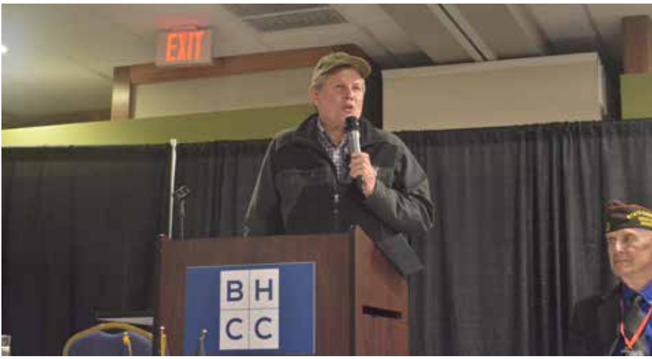
Senator: Steve Daines