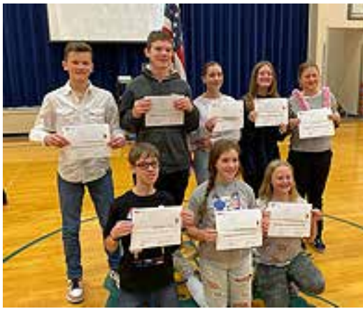
VFW Post 4042 Patriot's Pen winners from Cayuse Prairie School in Creston MT.