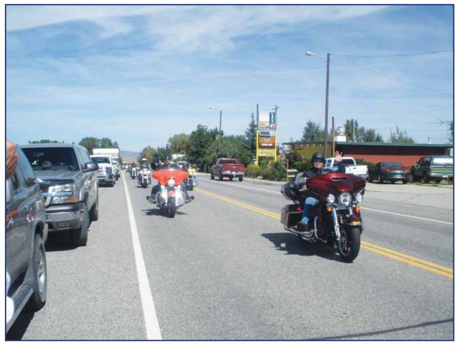
No one counted, but it is estimated that over 400 bikers participated.