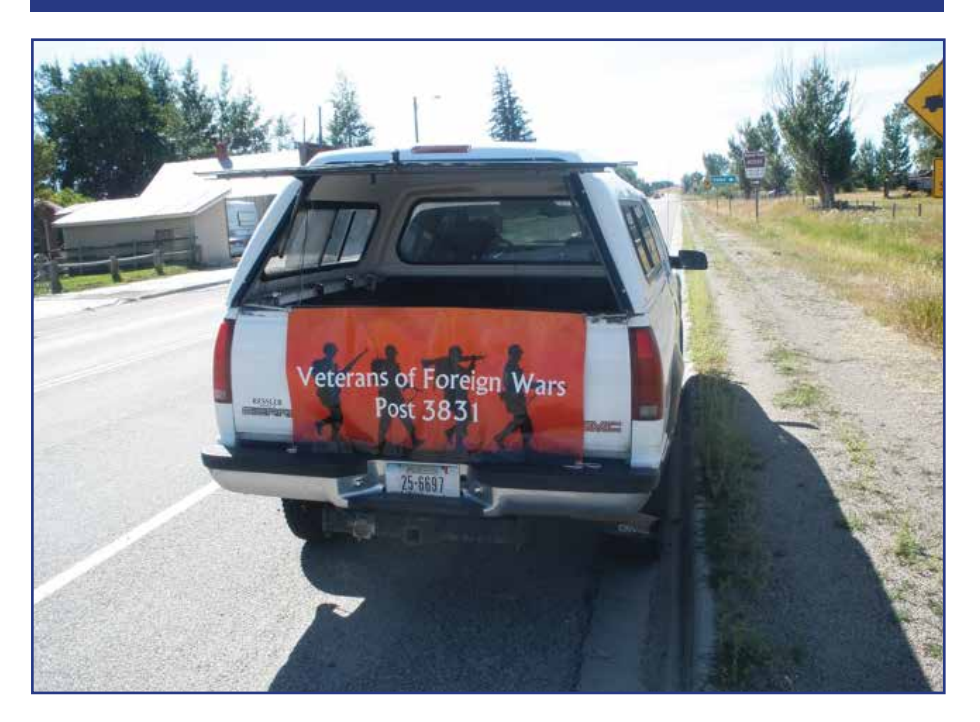
Members of VFW Post 3831 from Pony gathered in Harrison, Montana to wait for the 2016 Ride to Remember. The Motorcycle ride goes from Helena to West Yellowstone each year to honor our country's POW/MIA military personnel and focuses on Montana's 55 personnel specifically.

Join the VFW Action Corps here: www.vfw.org/weekly and receive the Washington Weekly e-newsletter and All VFW Action Alerts.