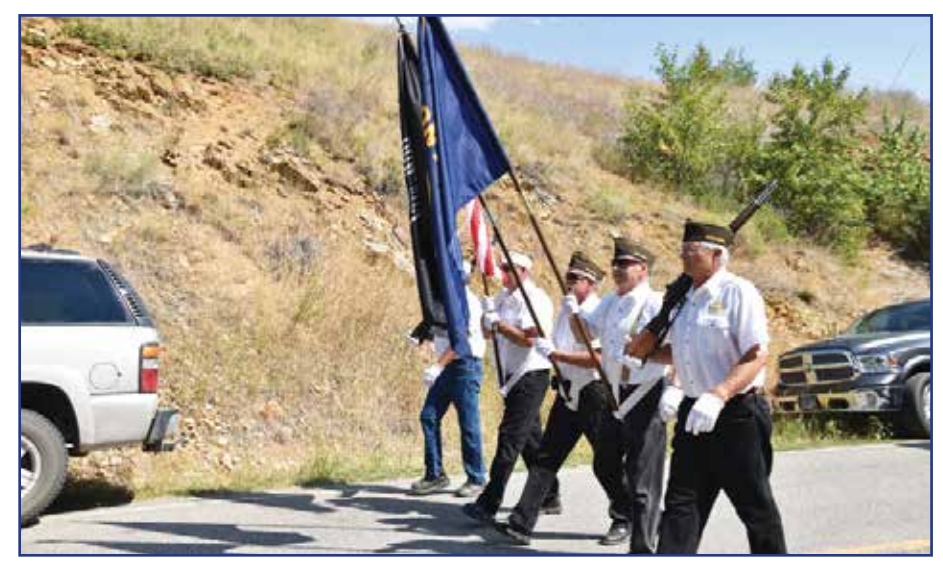
VFW Post 3831 leading the Pony Days Parade with colors on August 6, 2016.