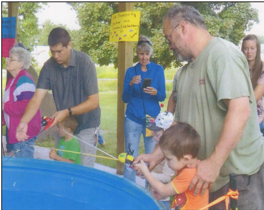
Younger kids fished in tanks and the older kids from the creek.