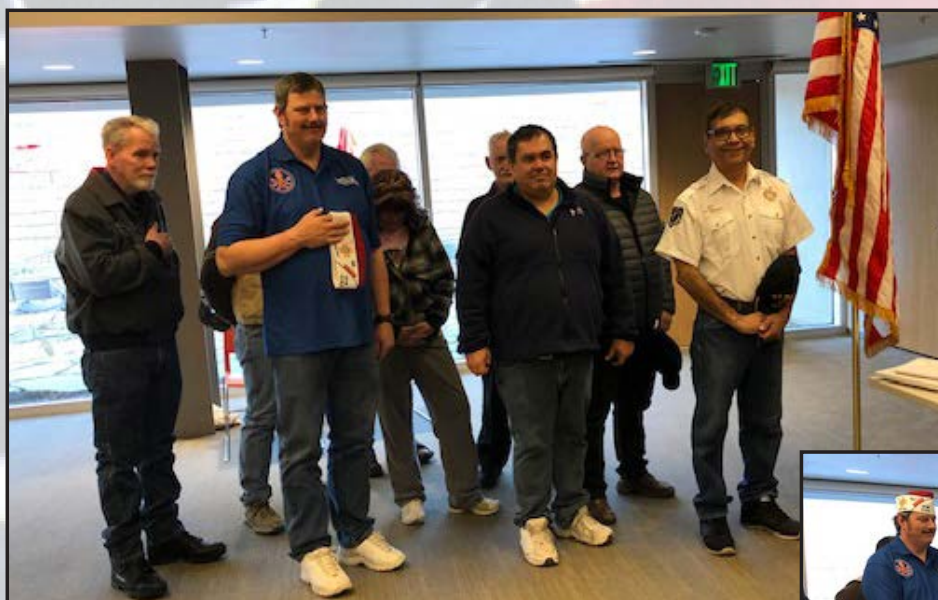
Post 12181 officers being sworn in.