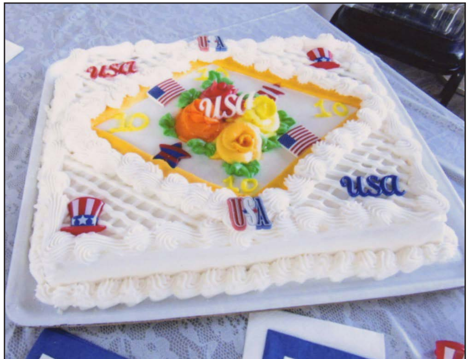
Ronan VFW Auxiliary 5652 celebrating their ten year anniversary on November 11, 2018.