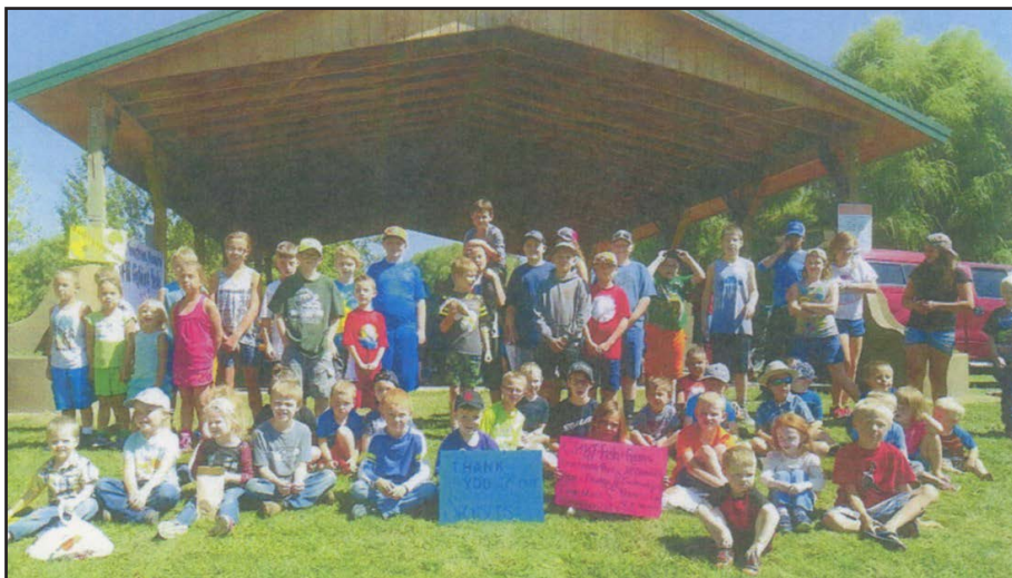
A group of fisher persons.