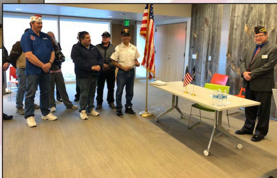
Post 12181 officers completing the institution process.