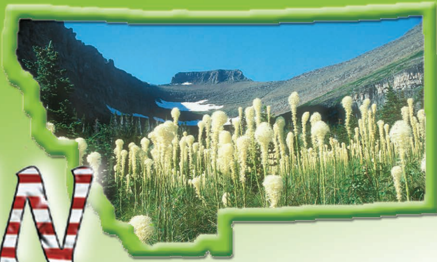
Glacier Park - Bear Grass