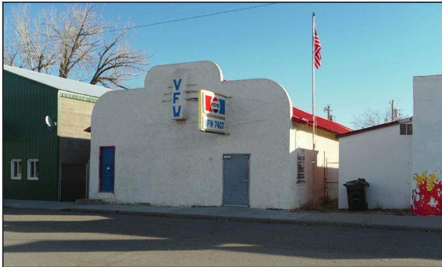
Before photo of the front.