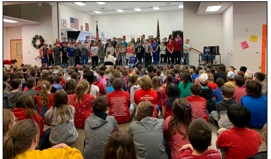
Each class grades 1-5 sang a patriotic song. The highlight of the concert was the 4th grade class singing "I'm Proud to be an American."