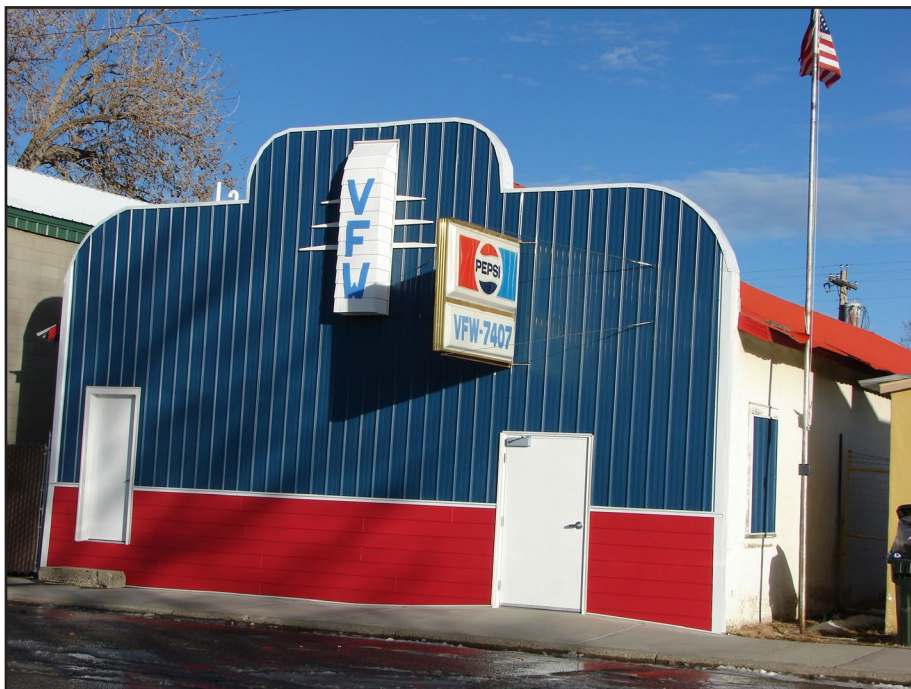
After photo of the front.