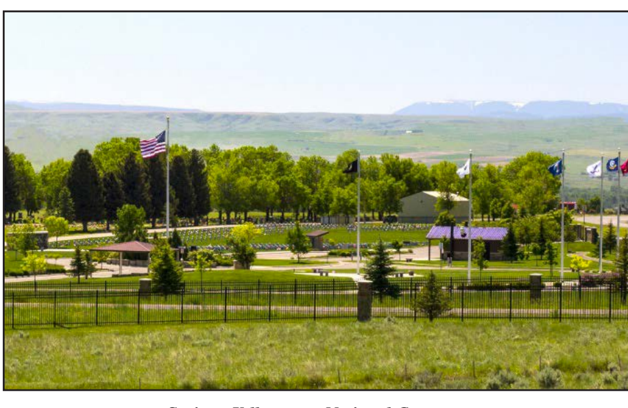
Spring • Yellowstone National Cemetery

The cemetery is the final resting place of over 1,000 veterans and their families. Photographs were taken in 2017/18.