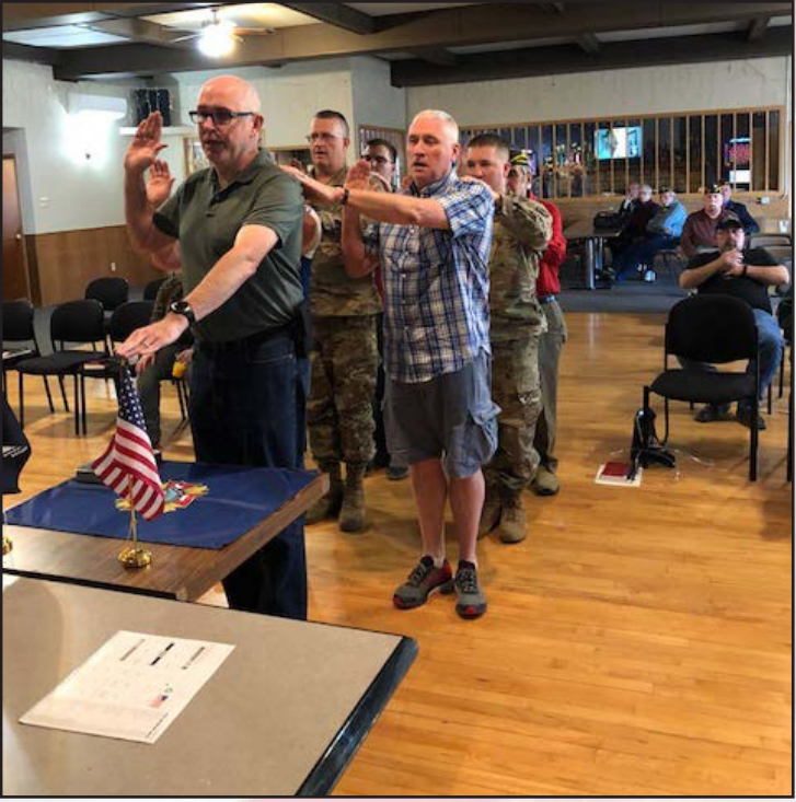
Post 12177 officers being sworn in.