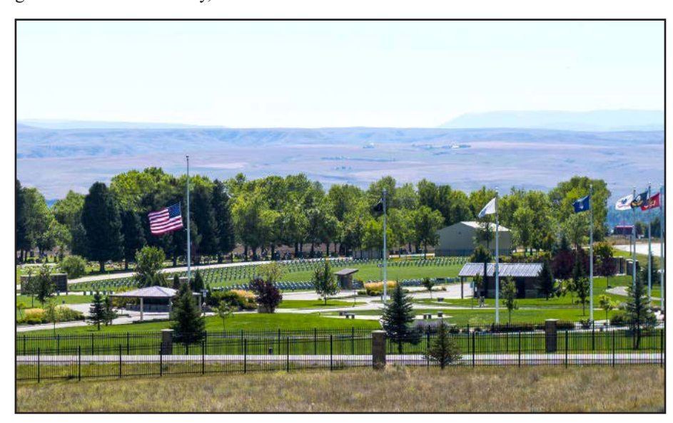
Summer • Yellowstone National Cemetery