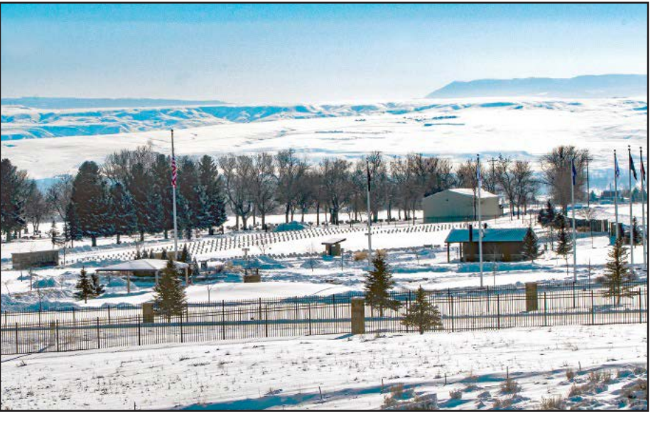
Winter • Yellowstone National Cemetery