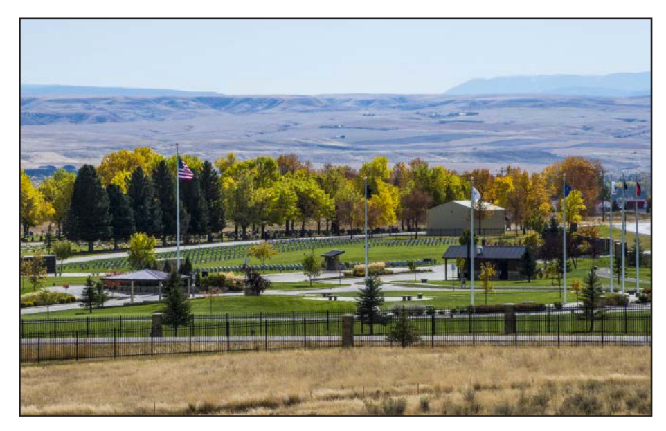
Autumn • Yellowstone National Cemetery