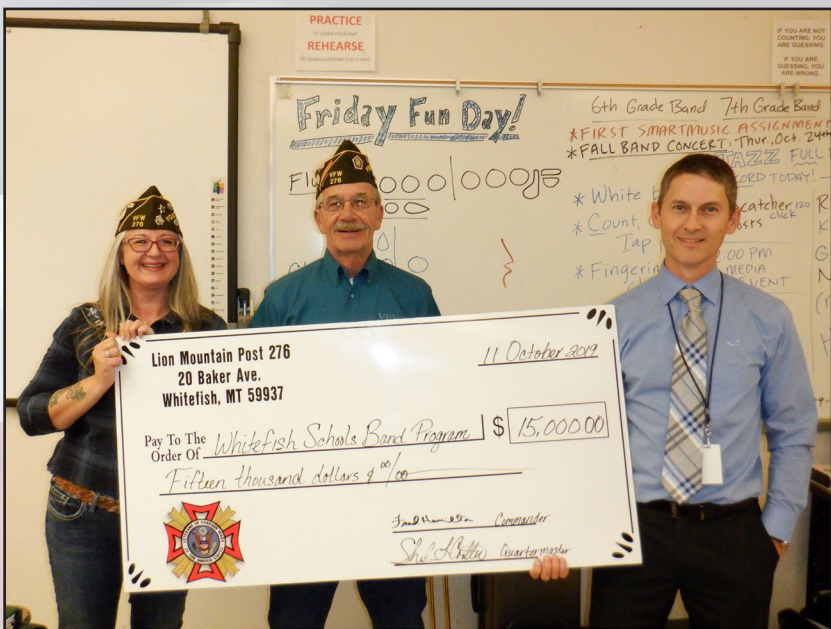
Whitefish Post 276 donated $15,000 to the Whitefish school district for the purchase of new band instruments.