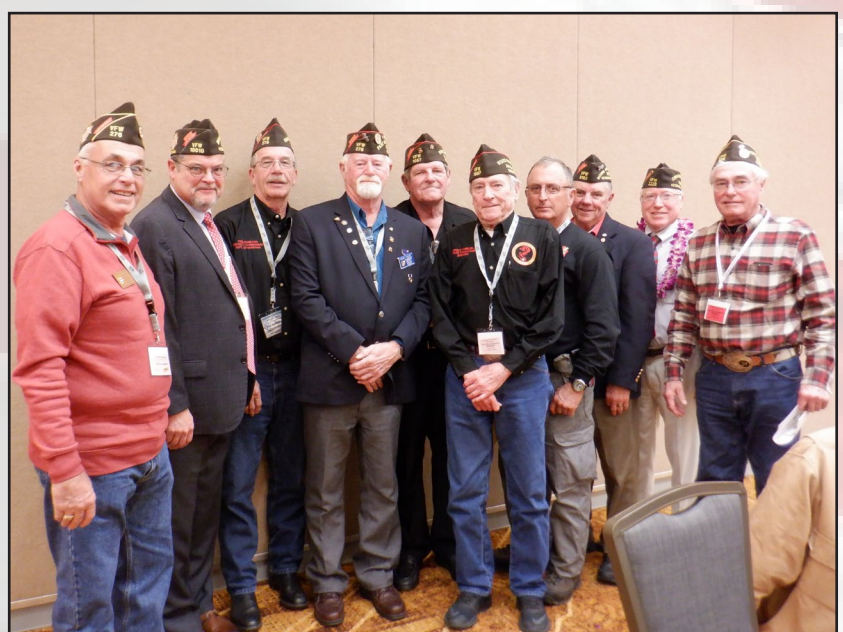
10 Montana delegates attended the Western Conference meeting in Anchorage Alaska in early November.