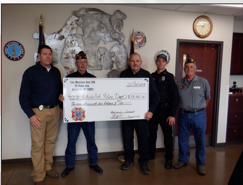
Whitefish Post 276 donated over $13,000 to the Whitefish police department for the purchase of body cameras for the entire police force.