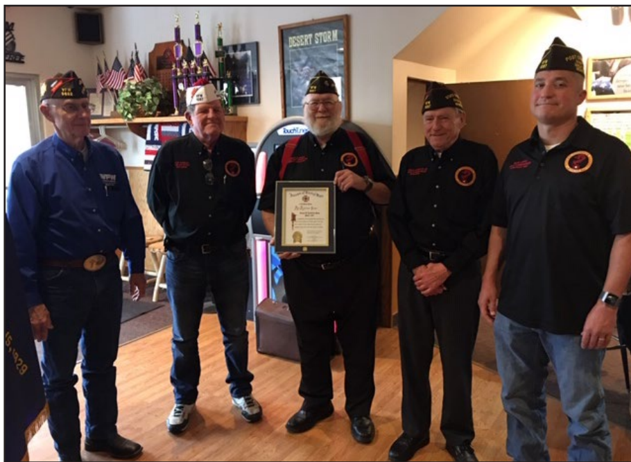
Great Falls Post 1087 receiving their All-American Post Citation.