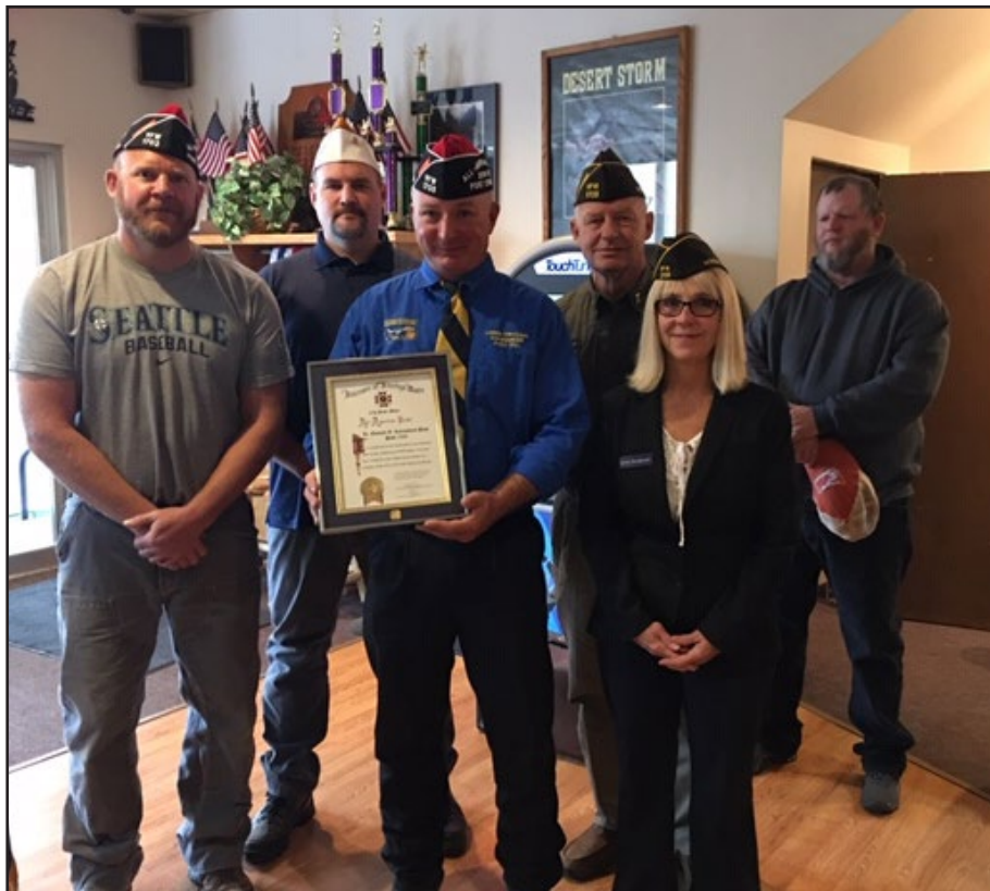
Lewistown Post 1703 receiving their All-American Post Citation.